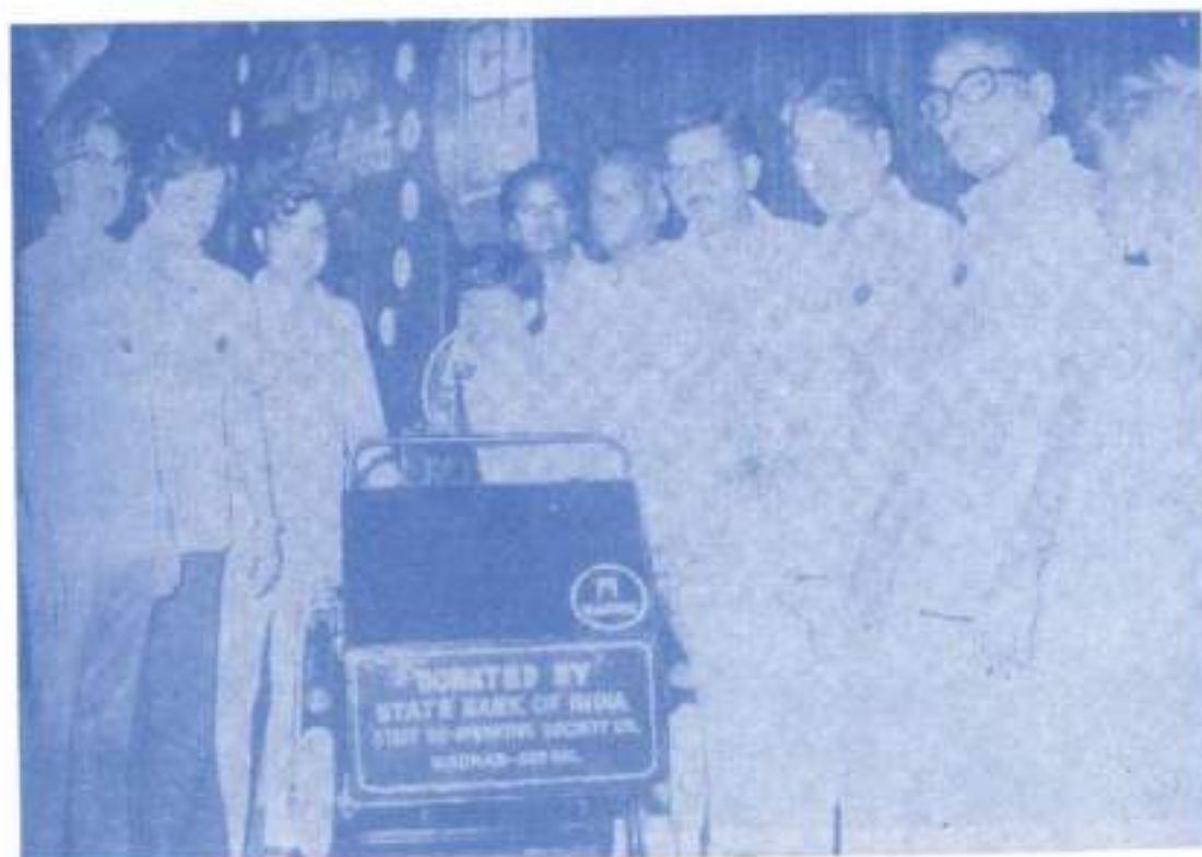
Tri-Cycle presented to a Physically Handicapped person. Office - Bearers & Directors - 1975 - 1976