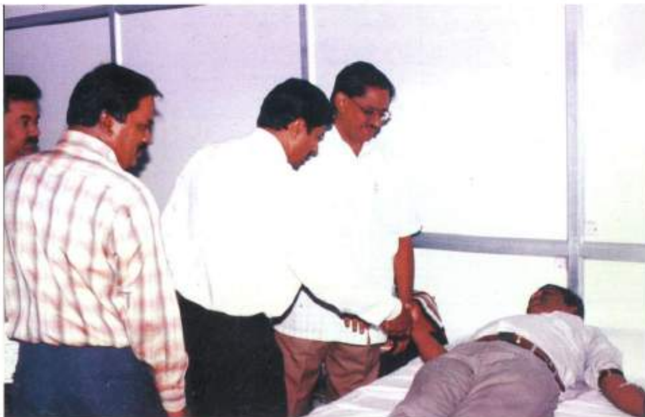
Blood Donation Camp at Indian Red Cross Society, Egmore.