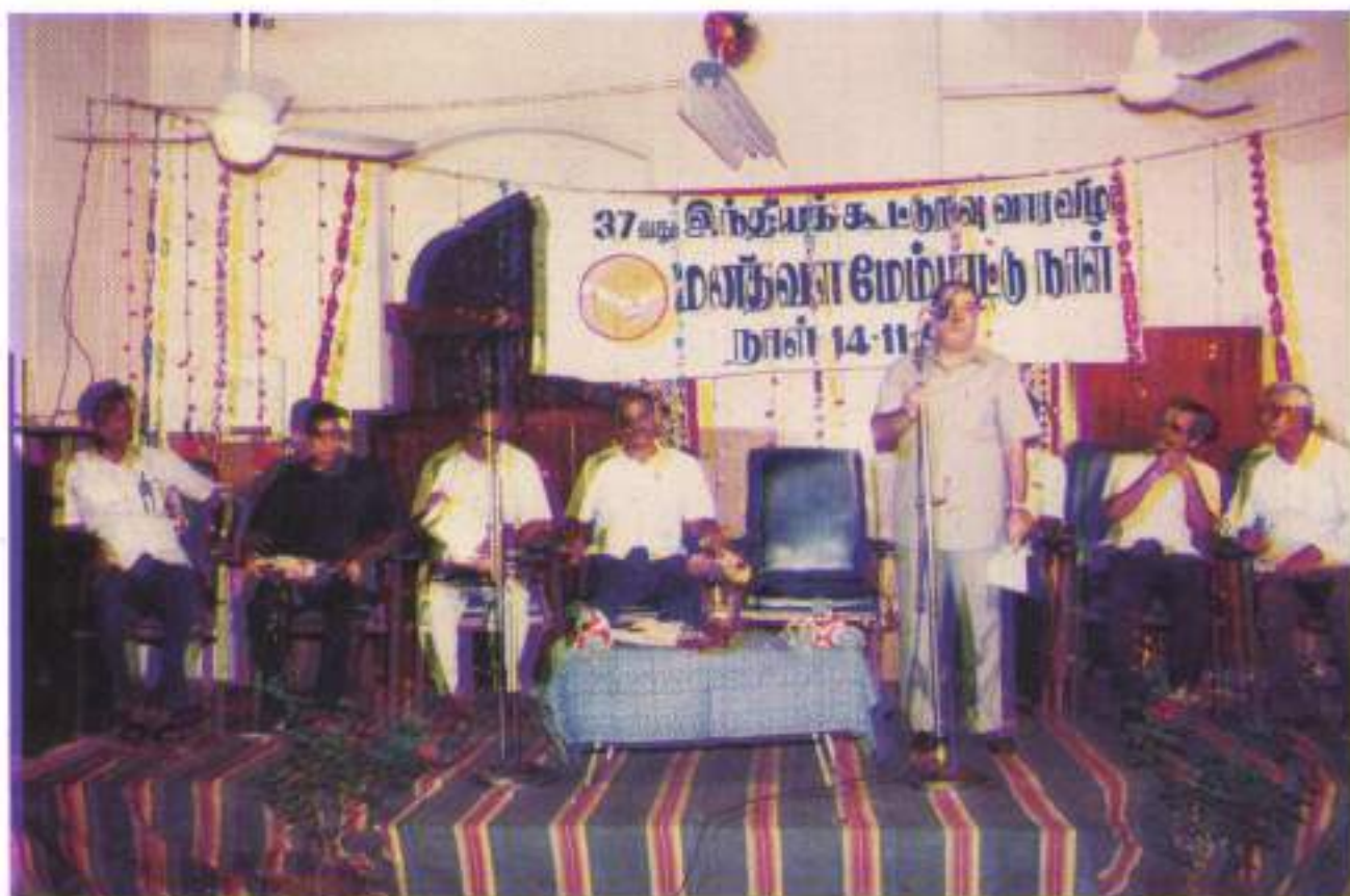
37th All India Co-operative Week Celebrations