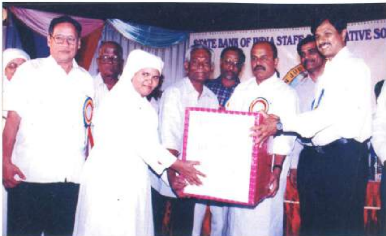
Hon'ble Minister for Co-operation Shri Pollachi V. Jayaraman presenting Welfare Aid to Little Sisters Orphanage, Chetput